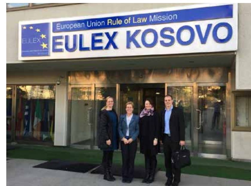
IECEU members visiting EULEX Kosovo

seen in the analysis of both CSDP "engagements" in the Balkans - EUFOR Althea and EULEX - have rather been used as long-term post-conflict capacity for institution building. Hence, one of the first discussions that should be resolved in the EU is whether it would be more suitable for the missions and operations to be deployed in the long run too. If the answer is positive, then the mandates and general approach of the EU should be adapted accordingly. This is of a particular importance in the light of the new EU Global Strategy, stating that CSDP "must become" more responsive and setting the EU approach very ambitiously. According to the Strategy, the EU will even expand its understanding of a 'comprehensive approach', reaffirming that "the EU will act at all stages of the conflict cycle, acting promptly on prevention, responding responsibly and decisively to crises, investing in stabilization, and avoiding premature disengagement when a new crisis erupts". 9