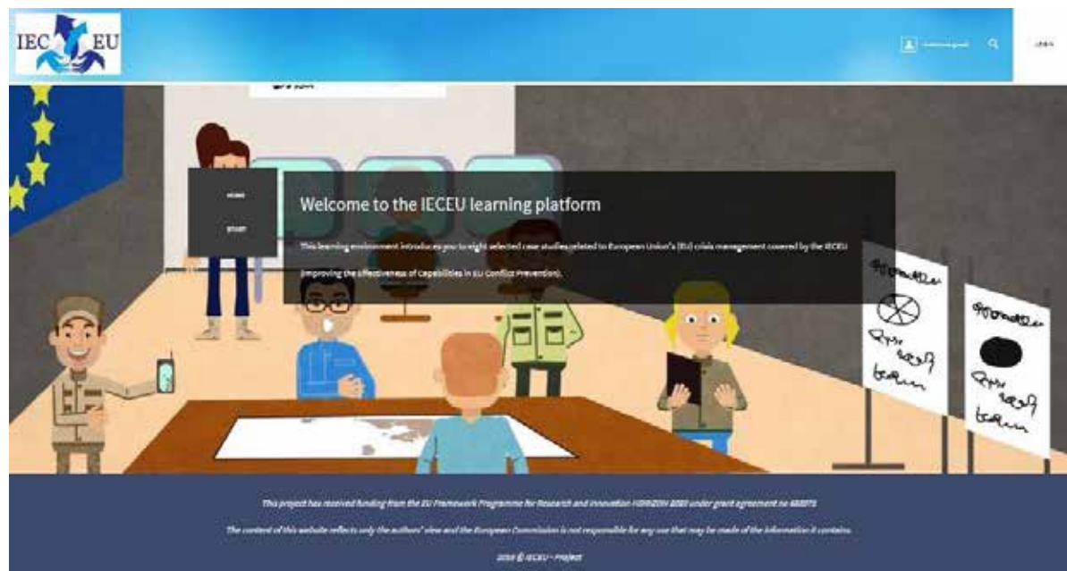
IECEU Learning Application includes number of rich visual and gamified learning contents.