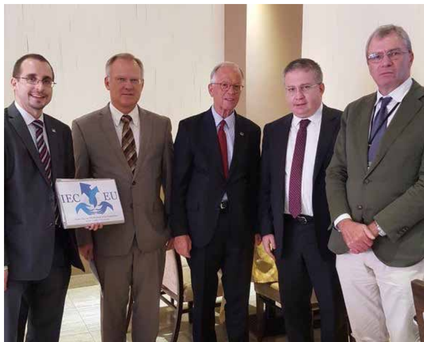
IECEU-delegation visiting South-Sudan

outbreak of the civil war had to be evacuated. The chapter will look into the main challenges the mission was confronted with as well as highlight some lessons learnt out of EUAVSEC.