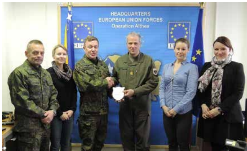
IECEU visiting the HQ Althea