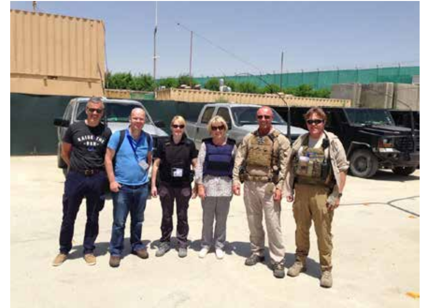
Members of the IECEU project on a field visit to Afghanistan

hundreds of armed militias in Libya were “largely out of control” 25 . When an invitation finally arrived, from the government of Prime Minister Zidan, the EU rushed to launch the mission, and therefore did not follow the normal procedure for constructing an Operation Plan 26 (OPLAN). 27 CSDP border related missions as standard require comprehensive assessment, such as evaluation of the country's present border capability, management needs, security, social, and political risks and vulnerabilities. This assessment is required to take place before a mission is established. 28 The quick mission launch, and lack of a proper situational assessment, was problematic as some of the political aspects, like the situation in Libyan politics, had changed since the original plan, and was not properly considered. 29 Another essential element blocking mission planning, was that in ultimo 2012, the south of Libya was declared a military zone, which meant the area was off limits for any international mission. This, according to Libyan interviewees, made the whole matter of border control insignificant. 30