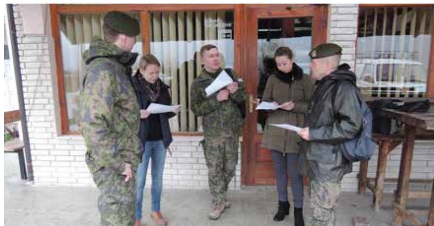
IECEU-delegation visiting Bosnia and Herzegovina

Among the findings that should be put into a comparative perspective, it was noted that in both Kosovo and BiH, that the factors threatening security and safety have, first and foremost, for several years been socio-economic, starting with